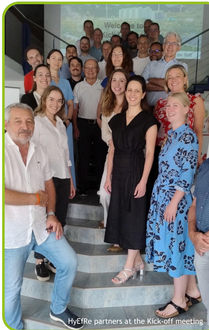
HyEfRe partners at the Kick-off meeting

The project partners will evaluate hydrogen potentials with new models and develop and test a new tool to calculate ideal parameters for technical plants. The project’s action plan for policy actors aims to reduce the regulatory barriers impeding a timely expansion of renewables and green hydrogen